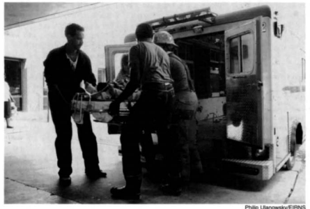
"One of the biggest health care emergencies in the United States is the lack of universal health insurance. Eighteen thousand Americans die each year because they don't have health insurance "

of the biggest health care emergencies in the United States, is the lack of universal health insurance. Eighteen thousand Americans die each year because they don't have health insurance. That's like a 9/11 every two months. I've got a paper coming out with a health policy colleague, called "When Health Policy Is the Problem." And what we are saving, is that health policy is in the way of solving this problem, if you believe that there should be universal health insurance, stop doing pilot projects, stop doing studies that show this and that, and implement universal health care.